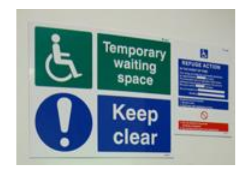
Disabled Refuge Signage – Sighthill Campus