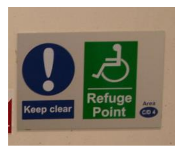
Disabled Refuge Signage – Craiglockhart & Merchiston