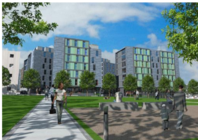
Bainfield Student Accommodation

As well as the successful completion of the Merchiston Campus Co-location project, a new 778 bed student accommodation residence in the city centre has been completed.