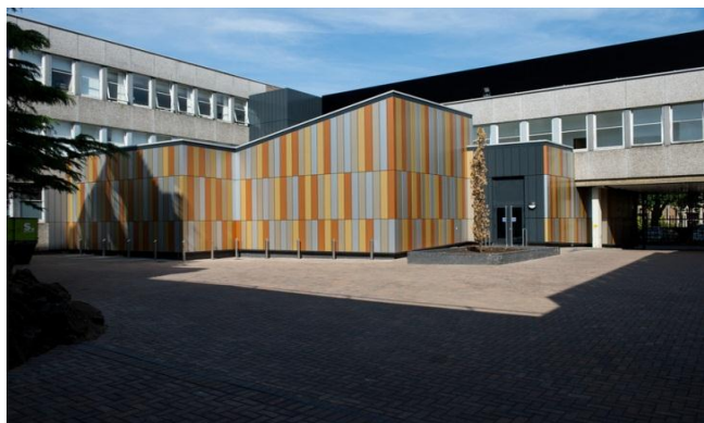
New Music Block at Merchiston Campus

multi-use space and a new build music area. Following the Co-location completion, works have commenced on an extensive window replacement roll out, modernisation of classrooms and general refurbishment works at the Merchiston campus. A new hospitality suite was also created at the Craiglockhart Campus.