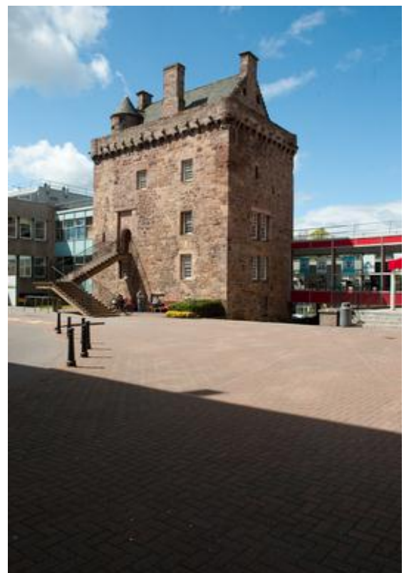
The Tower at Merchiston Campus