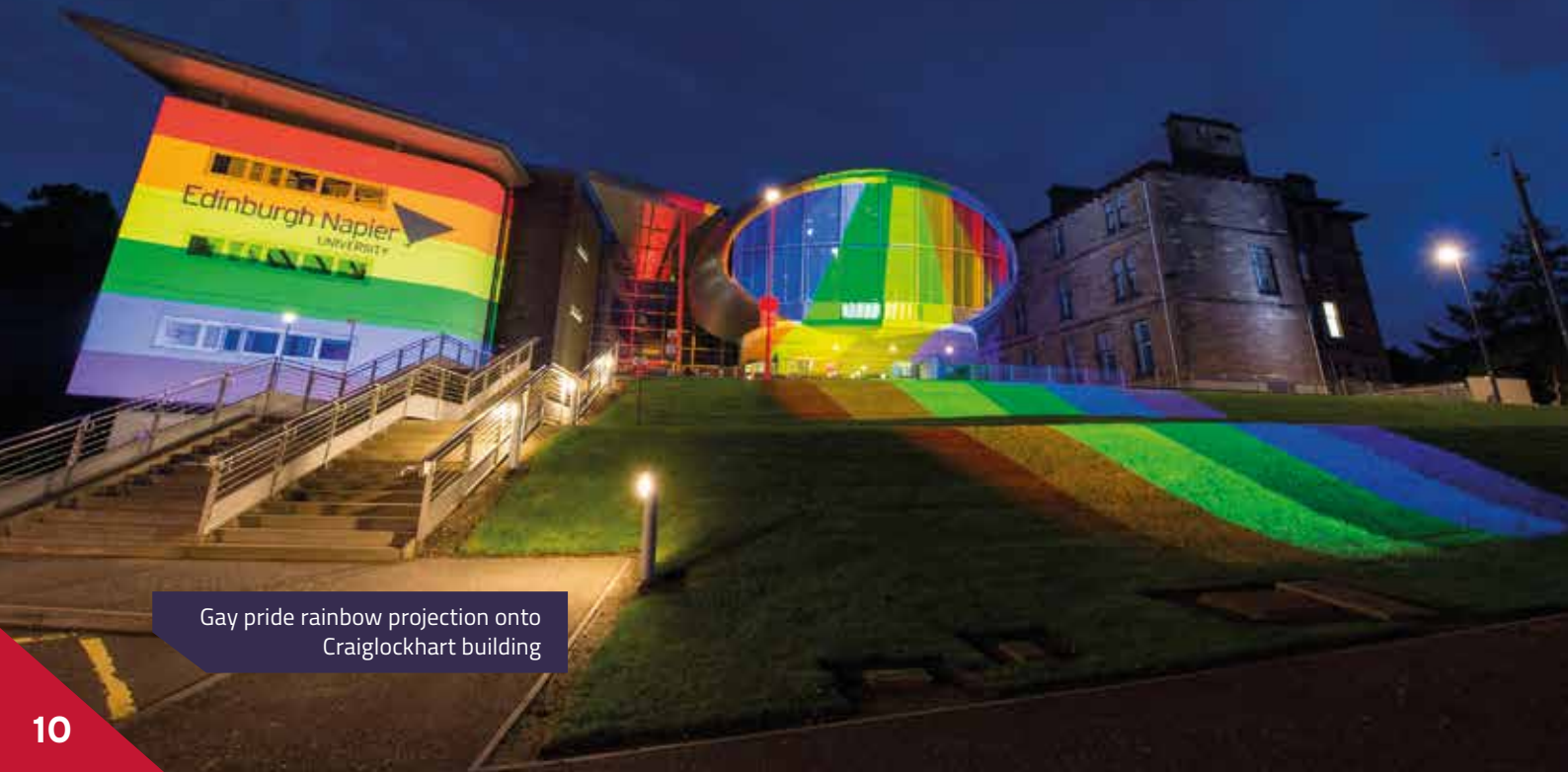
Gay pride rainbow projection onto Craiglockhart building