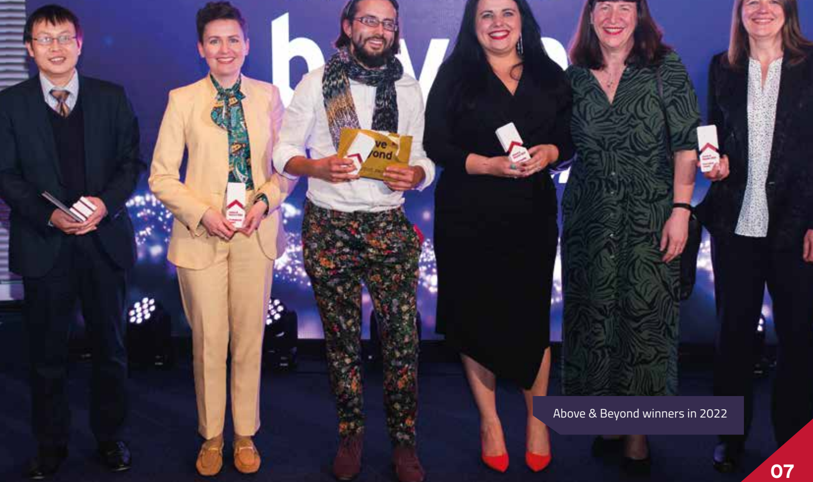
Above & Beyond winners in 2022