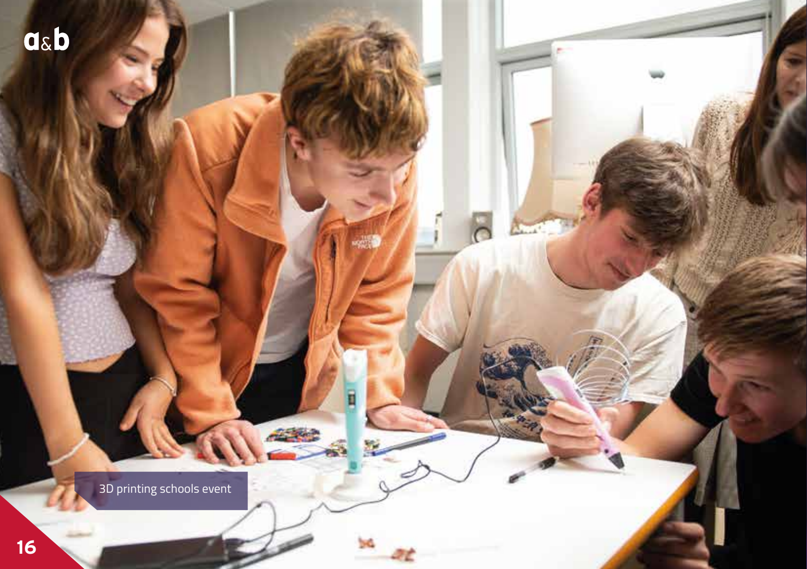
3D printing schools event