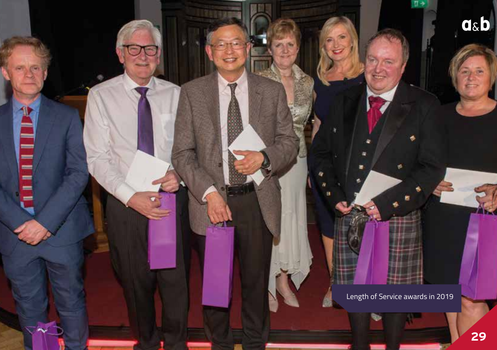
Length of Service awards in 2019